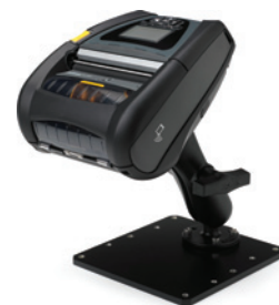
Plate and RAM mount arm permits compact and fixed mounting to a forklift.