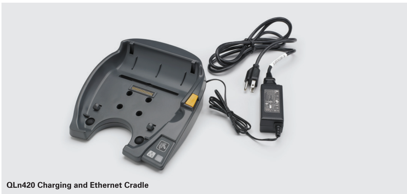
QLn420 Charging and Ethernet Cradle